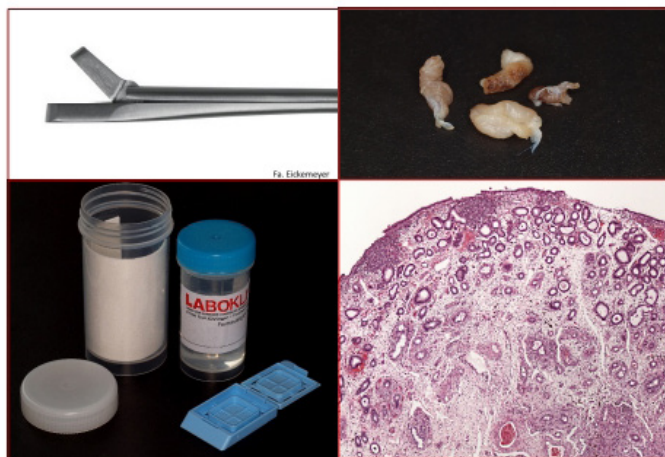
Fig. 1: Endometrial samples with a diameter of approx. 0.5 cm (top right) are obtained using uterine biopsy forceps (top left) and fixed in 10% buffered formalin (bottom left) immediately after collection. After preparing the samples in the laboratory, it is possible to perform a histological characterisation of the inflammatory processes (bottom right).

For a comprehensive assessment of chronic and/or deep endometrial inflammatory processes, the histopathological examination of endometrial biopsies is the method of choice. In barren mares, it is therefore recommended to do a biopsy combined with a bacteriological examination at the beginning of the season.