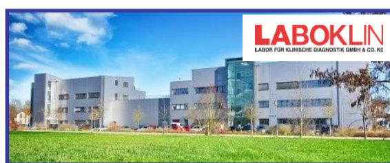
Laboklin, Bad Kissingen

From February 2015, with the cooperation of our partner LABOKLIN located in Germany, the laboratory has doubled in size and the spectrum of tests offered by BattLab had been greatly increased.