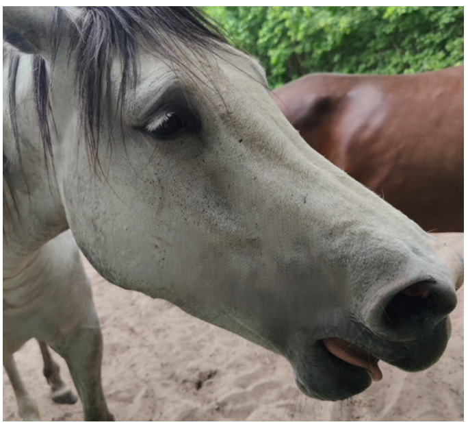
Figure 1: Horse coughing

pathogenesis (smoking and harmful gases). It is suggested to use mild, moderate and severe equine asthma and no longer use the other sub-terms.