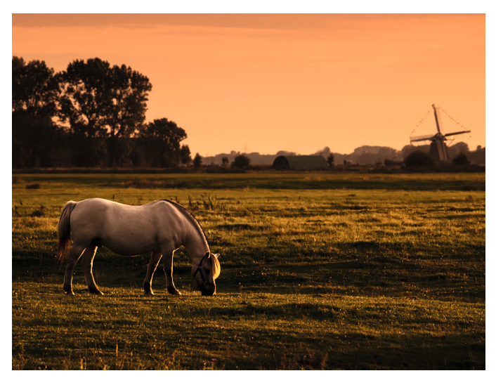
Figure 4: Horse on the pasture.

Allergen-specific immunotherapy (ASIT, hyposensitization) is an effective treatment option for many animals with allergic diseases. This treatment has been known since the 19th century. Based on the allergens to which the animal has shown positive reactions in the allergy test, an individual therapy solution is created especially for this horse. In principle, ASIT is always recommended when clinical signs persist for more than four months of the year. In seasonal events, it is recommended to start treatment at the end of the season. However, allergy testing should be done during or shortly after allergy season.