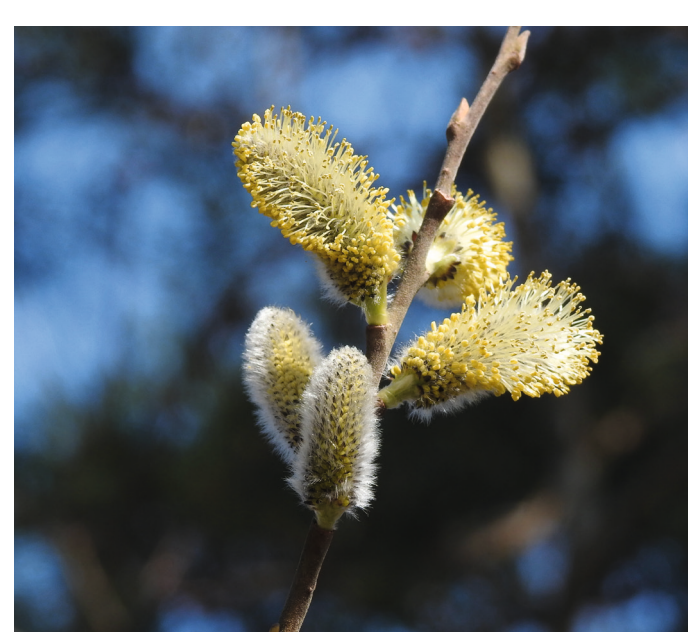
Figure 2: poller

An incidence of equine asthma of >14% has been reported in the equine population. Clinical signs are triggered by an allergic reaction to a wide variety of allergens, including mould spores in hay and straw dust, pollen, house-dust mites and storage mites present in barn dust and animal feed. Depending on the presence of the allergens involved, the disease can occur seasonally or all year round. Older stabled horses (>6 years) are primarily affected, whereby, among other things, barn climate, bedding material and type of feeding are viewed as factors involved in allergies. In winter, the air in the barn is especially polluted with fungal spores, and respiratory allergies occur with particular frequency at this time of year. In rare cases, specially in grazing animals, equine asthma occurs only seasonally. This problem is known as SPAOPD (summer pasture-associated obstructive pulmonary disease) the cause of which is a pollen allergy.