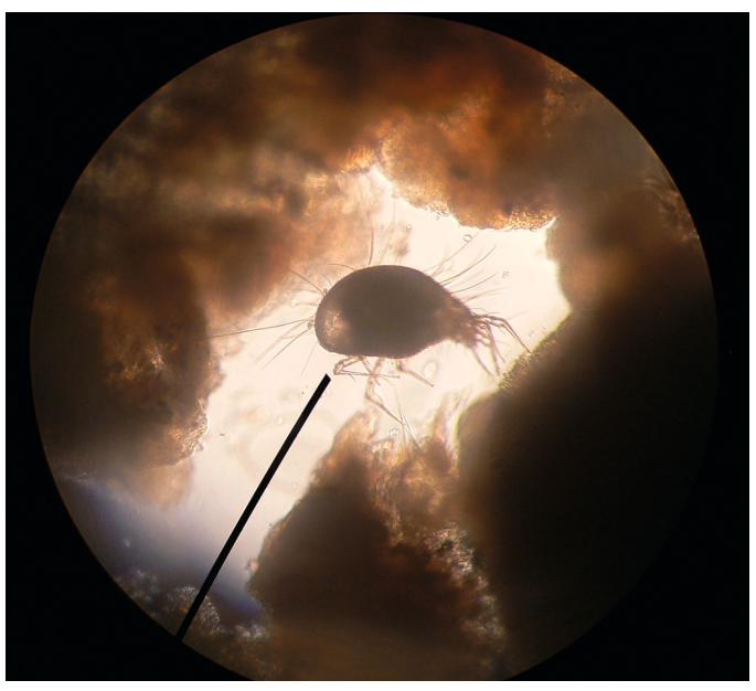
Figure 3: Microscopic image of a storage mite.

Before taking the blood sample, the withdrawal times for medication (especially glucocorticoids, including topical and inhaled) must be observed.